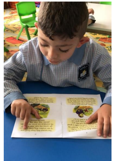
Figure 1 Kg3 student reading a Jolly Reader story fluently.

Kindergarten Teacher and Grade One Teacher