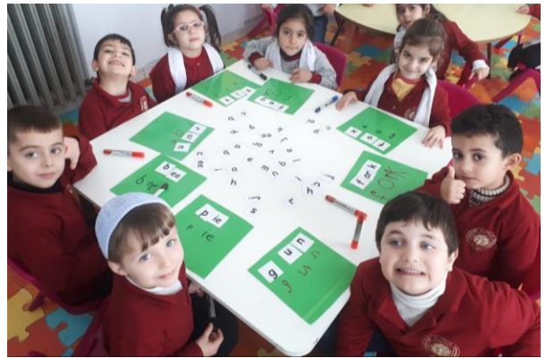
Figure 4 KG2 students blending words

Jolly Phonics facilitates reading and writing for the kids since it focuses on the sound that the letter makes instead of the letter's name. The jolly phonics pupil books serve the objectives intended for learning the language, where the first aim focuses on the 42 sounds and blending, the second and the third aim focuses on grammar and creative writing. The latter is a joyful ground for the kids, where they can, from a very young age, use writing to express their ideas without the limitations of their spelling capacity.